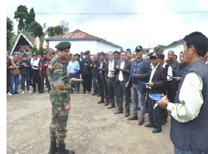
issues and resolving them.

In the Sequence of events, an enthralling Pipe band display was carried out followed by interaction with the ex-servicemen of Indian Army and Assam Rifles. The interaction was a positive step towards addressing their impending