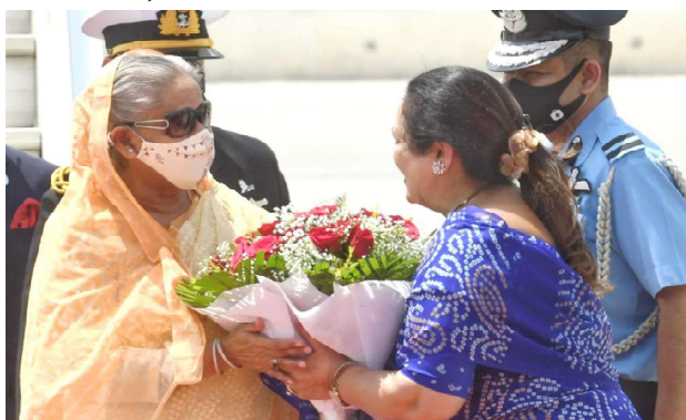
ing Hasina's visit.

Momen, who is also accompanying Hasina to India, said the agreements expected to be inked during the visit would be on water management, railway, science and technology, and information and broadcasting. Furthermore, the two sides are expected to ink an agreement on interim sharing of water of the Kushiya River during